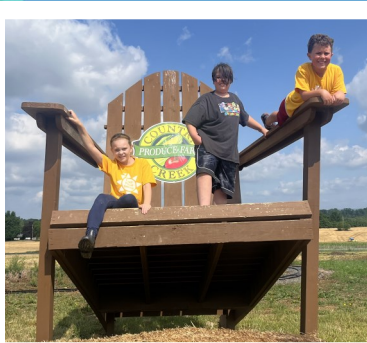
Farm Field Trip with friends, sunshine and berries!